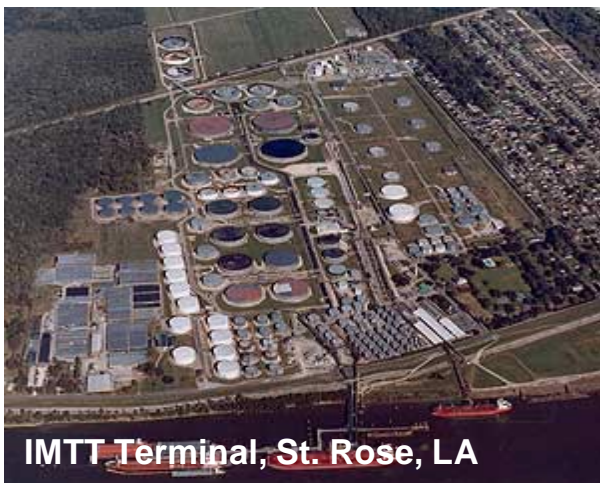
IMTT Terminal, St. Rose, LA