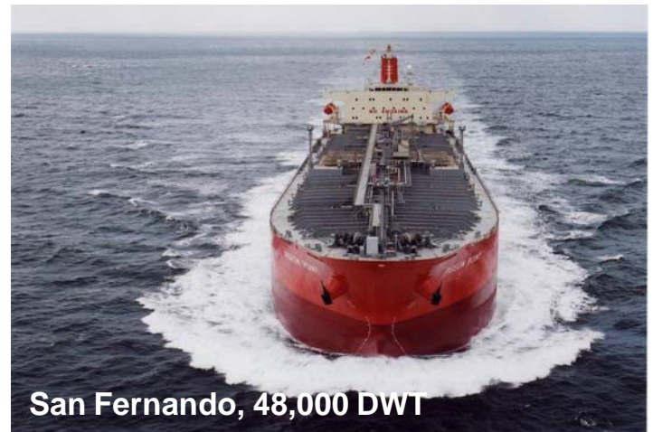
San Fernando, 48,000 DWT